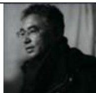
萬瑪才旦 Pema TSEDEN

萬瑪才旦，電影導演、編劇、作家；出版多部藏漢文小說集，包括《誘惑》（1997）、《死亡的顏色》（2013）、《塔洛》（2016）等，並獲翻譯成英、法、德、日、捷克等文字譯本，獲多個專業文學獎項。2002年，他開始電影編導工作，以拍攝藏語電影為主，代表作品包括《靜靜的嘛呢石》（2005）、《尋找智美更登》（2007）、《老狗》（2011）、《塔洛》（2015）、《撞死了一隻羊》（2018）等，透過深入而細緻的故鄉描述，讓人們對藏族文化及其生存狀況有新的體驗及認識。作品曾入圍威尼斯電影節、洛迦諾電影節、多倫多電影節等，並先後獲「最佳影片」、「最佳導演」、「最佳編劇」等近 40 項國內外電影大獎。