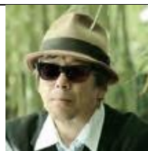
矢崎仁司 Hitoshi YAZAKI

1956 年生於日本，80 年代最備受推崇的獨立電影導演之一。1980 年，尚就讀日本大學藝術系的他即憑首部執導長片《午後微風》嶄露頭角，勇奪日本橫濱影展「最佳獨立電影」，一個人提著影片的16mm 拷貝走遍日本大學校園巡迴放映，成為一時佳話；相隔12 年後發表被譽為神作的《三月的獅子》(1992)，透過一個兄妹禁戀的故事，探討愛情的道德界線，獲比利時王室電影資料館「路易斯布紐爾黃金時代獎」。《無伴奏》是他2016 年的作品，根據小池真理子同名暢銷小說改編，重現1969 年日本學生革命時代的風韻，寫四名年輕男女的愛慾糾纏，獲俄國薩哈林影展「評審大獎」。他剛完成新片《Still Life Of Memories》(2018)。